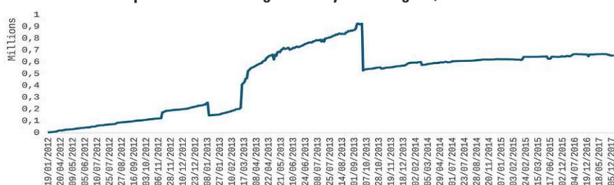
Graph 1: Number of Registered Syrian Refugees, 2012-2017