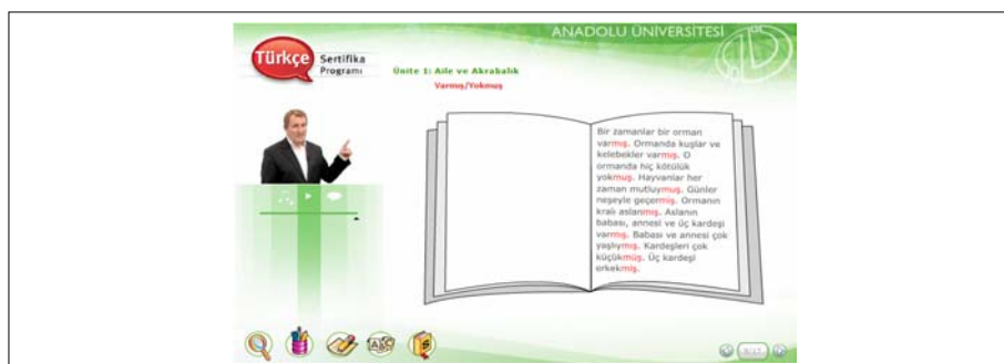
Figure 1. A sample lesson where the target forms have been made salient

In TSP, language skills are taught in the Lesson section. The lesson is presented by an anchorman. This part includes interactive animations and videos where the target forms and functions are used. The target forms and new vocabulary have been made salient by colours and they were reinforced by using videos. There are control buttons so that learners can control the anchorman's talk. Students can stop it at any time, control the volume, see the textual form of the anchorman talk, or they can watch the film starting from any point they like.