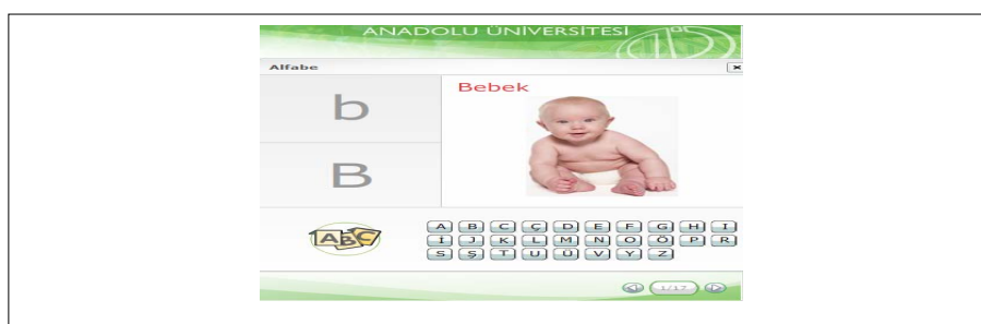
Figure 2. Sample page for learning Turkish alphabet

For new vocabulary and chunks, a Dictionary section has been designed. Each Turkish word has been vocalized. Translations of those words into English, French, or German are also available so that students can learn the meanings of the words. Each lesson includes a variety of activities such as multiple choice questions, matching exercises, choosing the right word or repetition drills. A virtual keyboard has been created so that students can use the letters that exist in Turkish such as ‘ç, ş, ğ, ö’ etc. There is also an Alphabet section. In this section, students can hear the pronunciation of all the 29 letters in Turkish. As figure 2 indicates, the pictures of the words having concrete meanings initializing with the target letter is shown in this section.